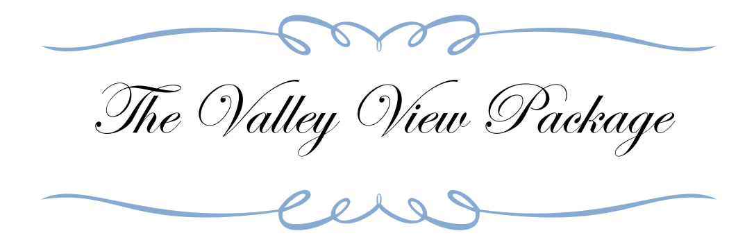
Tuesday - Saturday